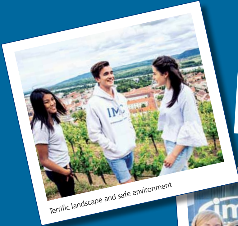
Terrific landscape and safe environment