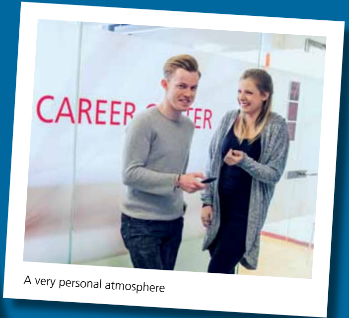
A very personal atmosphere