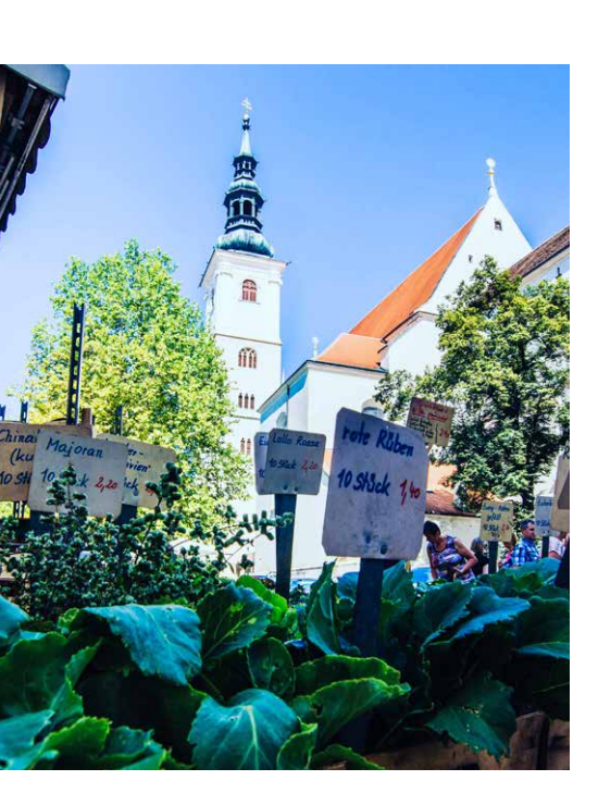
Under the following link you can find tips for your leisure program/free time: